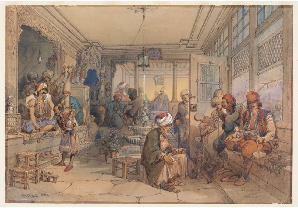
Dims: 40.7 x 58.8 cm Object: Watercolour Place of origin: Turkey Date: 1854 (painted) Artist:Aloysius Rosarius Amadeus Raymondus Andreas Preziosi 5th Ct. Preziosi (1816–1882) Medium: Pencil and watercolour Loc.: V&A

Preziosi (1816–1882) was a Maltese painter known for his watercolours and prints of the Balkans, Ottoman Empire and Romania. He was acclaimed for his vibrant and evocative images of diverse nationalities and cultures in the city of Istanbul. Many 19th century Western European travellers took his drawings home as souvenirs of their visit.