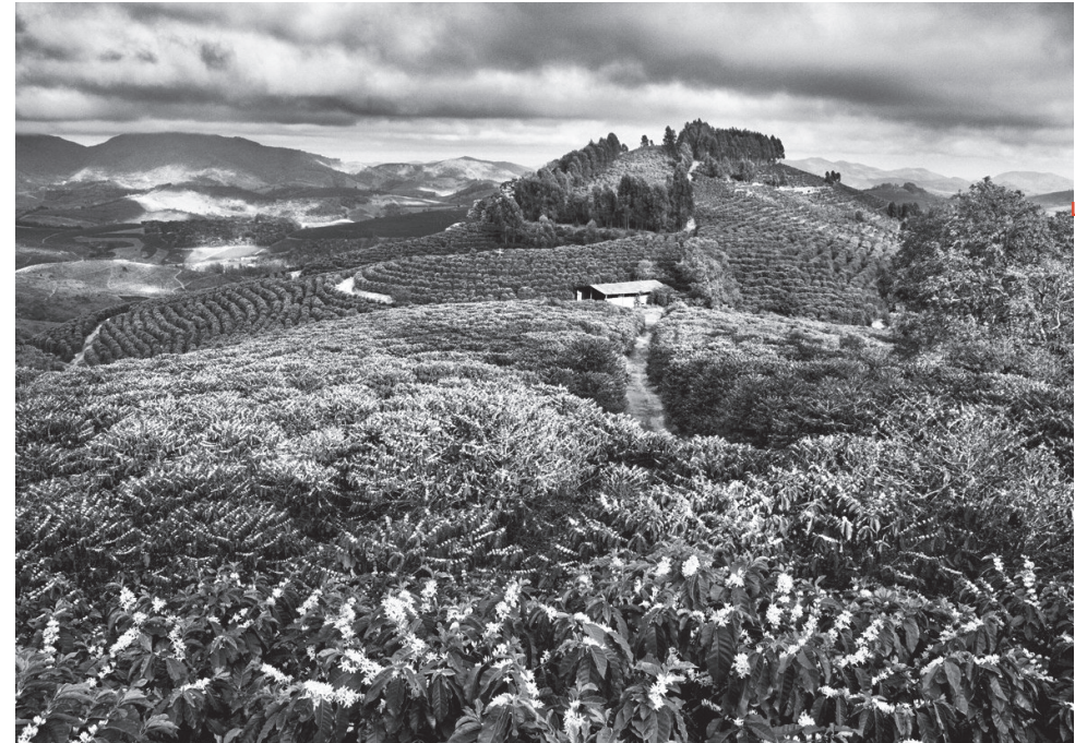
Dims: 24 x 35cm Medium: Photograph Loc.: London, Beetles + Huxley Gallery