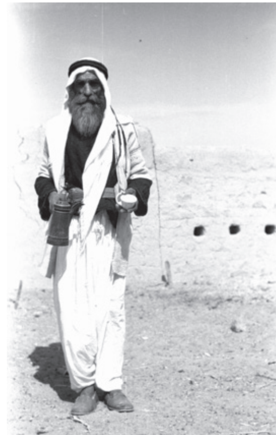
Dims: 30 x 40 cm Photographer: Wilfred Patrick Thesiger Date: September - October 1950 Format: Film Negative 35mm Loc.: Pitt Rivers Museum, Oxford, UK.

This portrait of a Yazidi coffee maker by Wilfred Thesiger demonstrates the versatility of coffee as a beverage, but also how coffee is consumed across various social and cultural contexts. The journeys and explorations of Wilfred Thesiger between 1945 and 1950 across the Arabian peninsula were well documented by his own writings and photography. While Thesiger described the Yazidi men as having "distinctive and becoming garb" what we see in this photograph is the ubiquity of coffee, even in the remote desert setting of Kurdistan, Iraq. The man holds a tall metal pot with a small cup in his left hand, suggesting that the coffee is taken in small doses, quite possibly without milk. Seen in the context of the other artworks in the exhibition, we see that coffee is not just consumed in a social setting, but that it also facilitates an individual consumptive desire or need. Despite the remote setting, as Thesiger describes in his writings: "I suspect that few foreigners had ever seen as much of this country as I did during those eight months," we should not be surprised that coffee was consumed in this region: Coffee cultivation began in the Arabian peninsula and was for the next 300 years, an Arabian monopoly. In the 15th century, coffee cultivation was found in the hills of Yemen, by the 16th century it had spread to Persia, Egypt, Syria and Turkey.